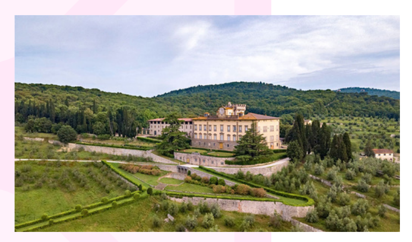
Torre a Cona

Torre a Cona is one of Tuscany's best-kept secrets. Nestled in the Florentine hills with unforgettable view of the countryside, the charming 18thcentury villa makes an immediate impression. Surrounded by olive groves, lush vineyards, and sturdy centuries-old walls, the estate has been lovingly restored with care and elegance.